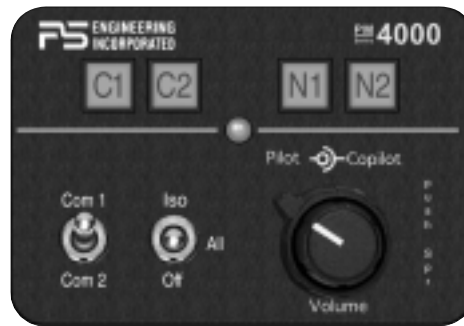
Shown actual size

An optional internal digital recorder (p/n 11941) can provide up to one minute of stored aircraft radio reception. This device is a continuous loop recorder that automatically starts recording the instant a radio transmission is received, with no dead air time recorded. By pressing a momentary switch, the last recorded messages will be replayed. Up to 16 messages (or 1 minute) can be stored.